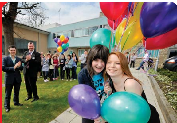
Chalkhill staff, young people who use the unit, and Rockinghorse staff gather to celebrate the hospital's first birthday

On 9 April, Chalkhill Child and Adolescent Mental Health Unit in Haywards Heath celebrated its first birthday. The rebuilding project, which Rockinghorse supported with help from a long list of generous donors, was a resounding success. One year on, the staff and young people who use the centre are delighted with the bright, accessible facilities and the fantastic equipment available to them. Guests at Chalkhill's birthday party were treated to performances by young people who had been learning circus skills and those who had put together a band whilst staying at the centre.