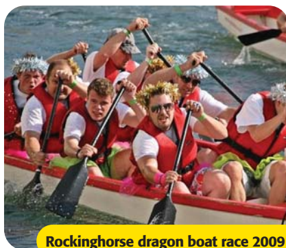
Rockinghorse dragon boat race 2009

So what are you waiting for? Drum up your support for Rockinghorse today! For a registration form visit www.funraisers.org.uk or call Emma Millar at Rockinghorse on 01273 730286 or email emma.millar@rockinghorse.org.uk . Please make registration cheques payable to 'Funraisers.'