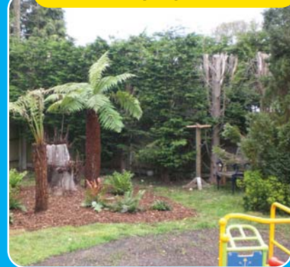
The redeveloped garden at Finches

Rockinghorse is pleased to announce that the £50,000 redevelopment project for a new accessible garden at Finches Respite Centre in Burgess Hill is now complete. We will be celebrating the garden's official opening in July so we shall bring you more news and pictures in our autumn newsletter.