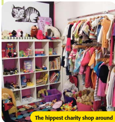
The hippest charity shop around