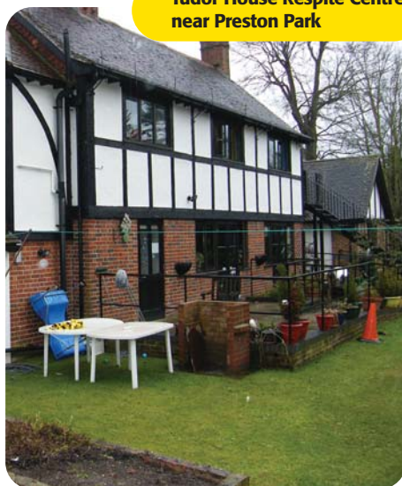
Tudor House Respite Centre near Preston Park