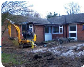
Work gets underway at Finches and artist's impression

A fabulous example of our work with respite centres is at Finches in Burgess Hill, where, now that the snow has cleared, work has begun on transforming the garden into an adapted play area, with sensory stimulus and wheelchair accessible play equipment.