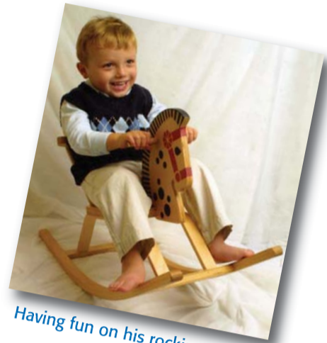
Having fun on his rocking horse, aged 3