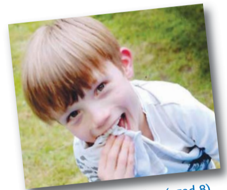
Playing in the garden (aged 8)