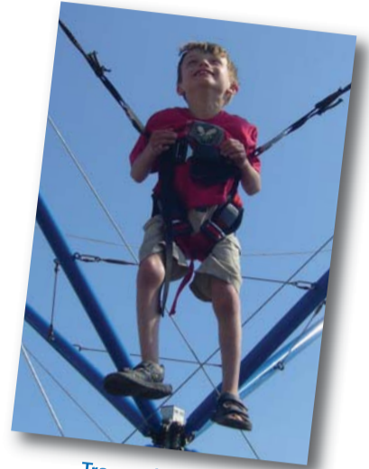
Trampolining on Brighton beach

P.S. I'm running the London Marathon next year to raise funds for Beeches. You too can make a difference today by donating what you can to Rockinghorse. Paul.