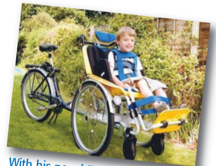
With his new bike, we can now go out cycling as a family